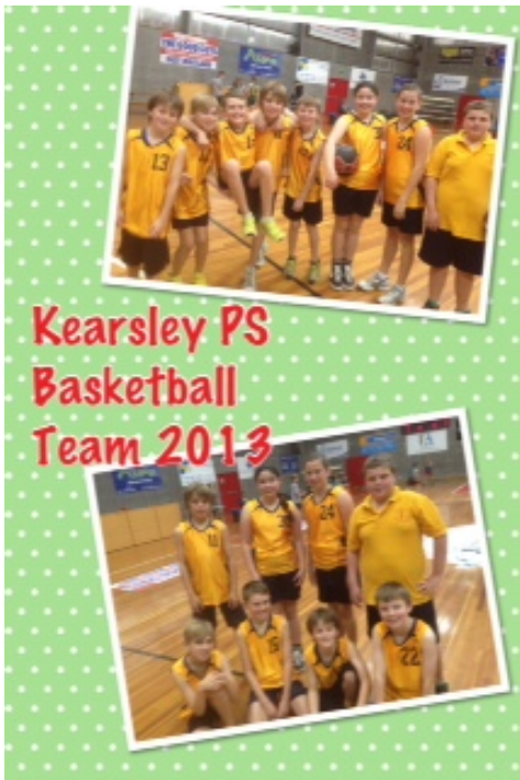
Kearsley PS Basketball Team 2013